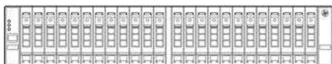
HP 3PAR StoreServ 7200 Storage

HP 3PAR StoreServ 7000 is storage made effortless.