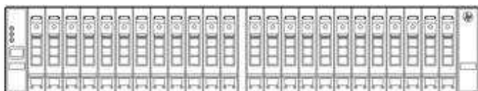
HP M6710 2.5 inch 2U SAS Drive Enclosure

Add drive enclosures to expand the configuration and to add large form factor drives to the configuration. Drive enclosures can be ordered separately for installation in the field, or they can be factory configured in a rack. Drive enclosures are optional. Because the Storage Base products and the Upgrade Node Pair include small form factor drive bays, the minimum configuration does not require any additional drive enclosures. For larger configurations, attach drive enclosures. Each drive enclosure includes 24 drive bays. The HP 3PAR StoreServ 7200 supports up to five (5) added drive enclosures. The HP 3PAR StoreServ 7400 supports up to nine (9) added drive enclosures per node pair. The two drive enclosure types can be intermixed in a single array.